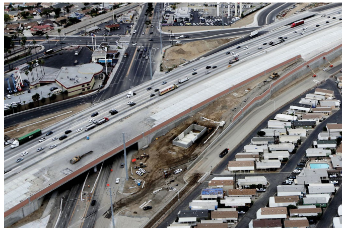
A rebuilt Rosecrans Avenue crosses under Interstate 5 in Norwalk. Also reconstructed, Bloomfield Avenue, at top, intersects Rosecrans.

The project also includes wider freeway shoulders, concrete median barriers, improved ramp designs, realignment to Firestone Boulevard, and interchange modifications at the Rosecrans and Bloomfield Avenue undercrossings.