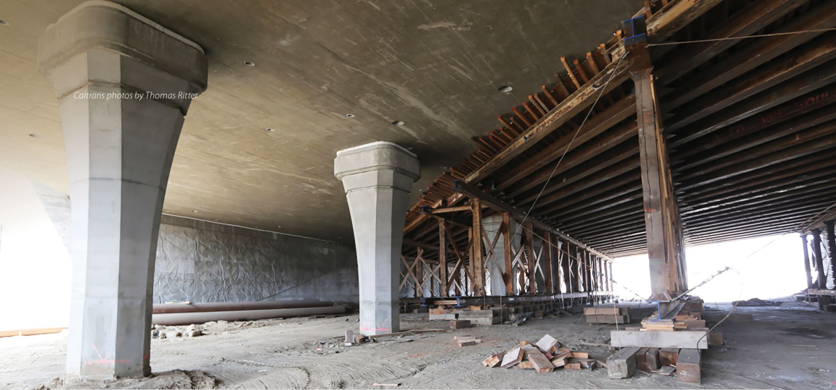
As part of its I-5 Rosecrans Avenue/Bloomfield Interchange Project, Caltrans elevated the interstate and constructed this new undercrossing at Bloomfield that rejoins parts of Norwalk that had been cut off by the original I-5 construction in 1954. This photo was taken in 2016.