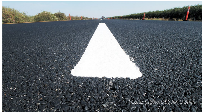
A section of new-generation road striping was recently laid on Interstate 5 near Orland, about two hours north of Sacramento.

It also will be a better roadway guide for autonomous vehicles. Caltrans has consulted with auto