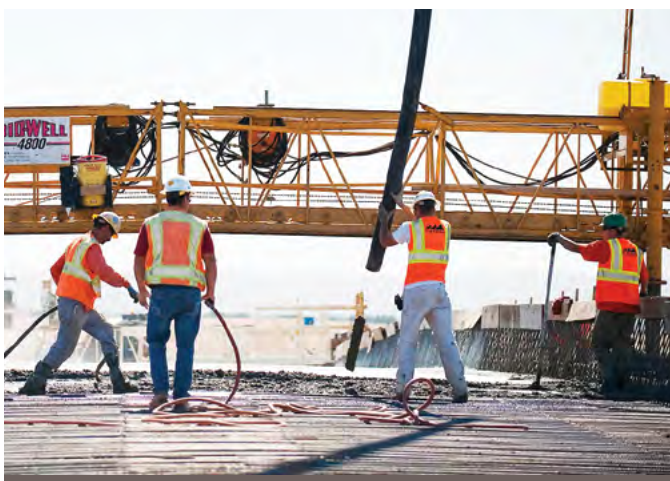
The completion of most Proposition 1B projects has resulted in an 11 percent decrease in project direct staffing in just the last six years.