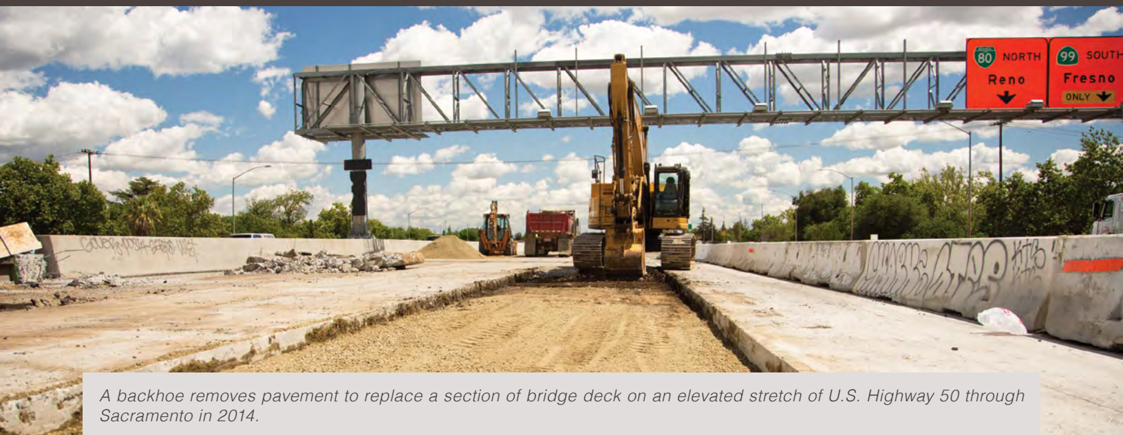
A backhoe removes pavement to replace a section of bridge deck on an elevated stretch of U.S. Highway 50 through Sacramento in 2014.

Year-End Tally: 239 Projects Ready for Construction