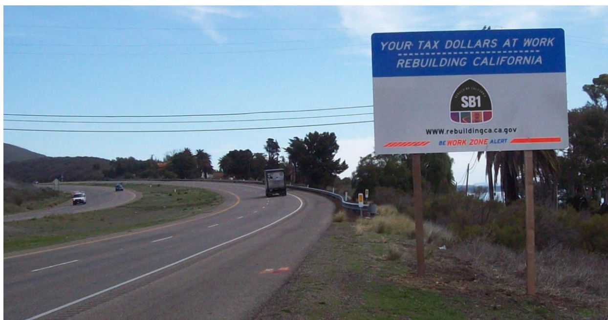
Southbound US-101 at Refugio Creek Bridge.

Caltrans is committed to conducting its business in a fully transparent manner and detailing its progress to the public. For complete details on SB 1, visit http://www.rebuildingca.ca.gov/ .