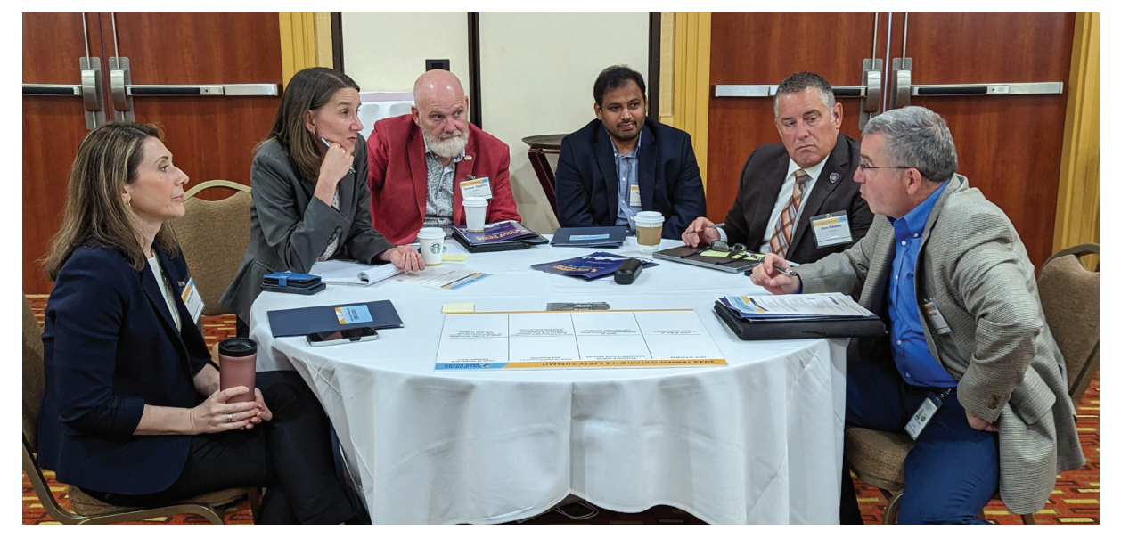
2023 SHSP Transportation Safety Summit attendees engaging in roundtable discussions during the Summit

Summit participants collectively brainstormed possible strategies to address the above challenges, which are currently being discussed amongst the SHSP Steering and Executive Leadership Committees. Some key themes that emerged during the Summit include a desire for additional partnerships and sharing of best practices of transportation safety countermeasures, as well as a desire for improvements to data collection and analysis, all of which will enhance collaborative, performance-based decision-making. The input and recommendations received during the Summit will be categorized into three main areas: 1) possible new actions that can be included in the SHSP Implementation Plan, 2) enhancements to the overall SHSP and its processes, and 3) identification of policy-related challenges that are outside the purview of the SHSP, but that can be elevated to the appropriate partner agencies for additional consideration. The SHSP Team is excited by the momentum gained during this in-person event and will use it to further strengthen partnerships and achieve the Mission, Vision and Goal of the SHSP.