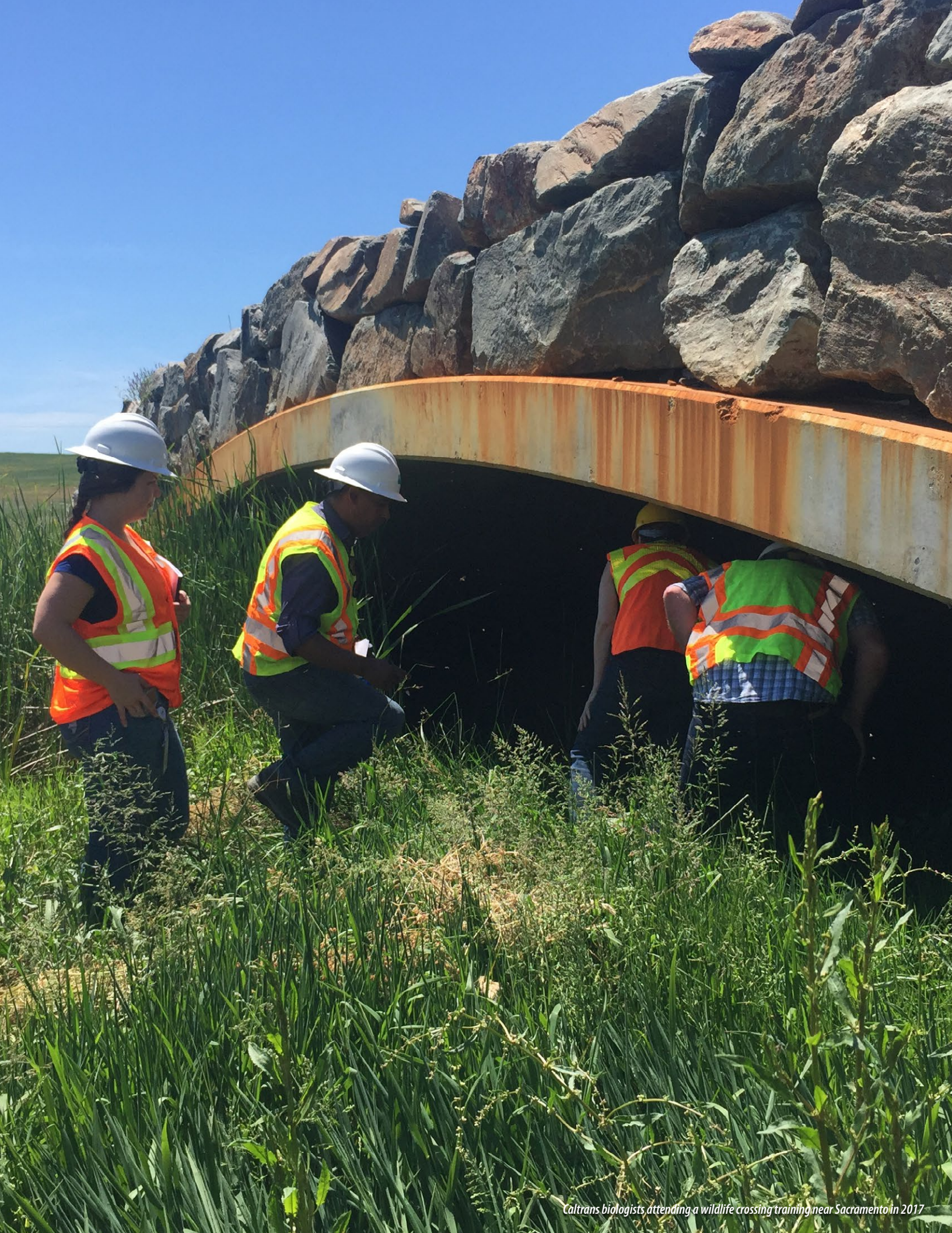
Caltrans biologists attending a wildlife crossing training near Sacramento in 2017