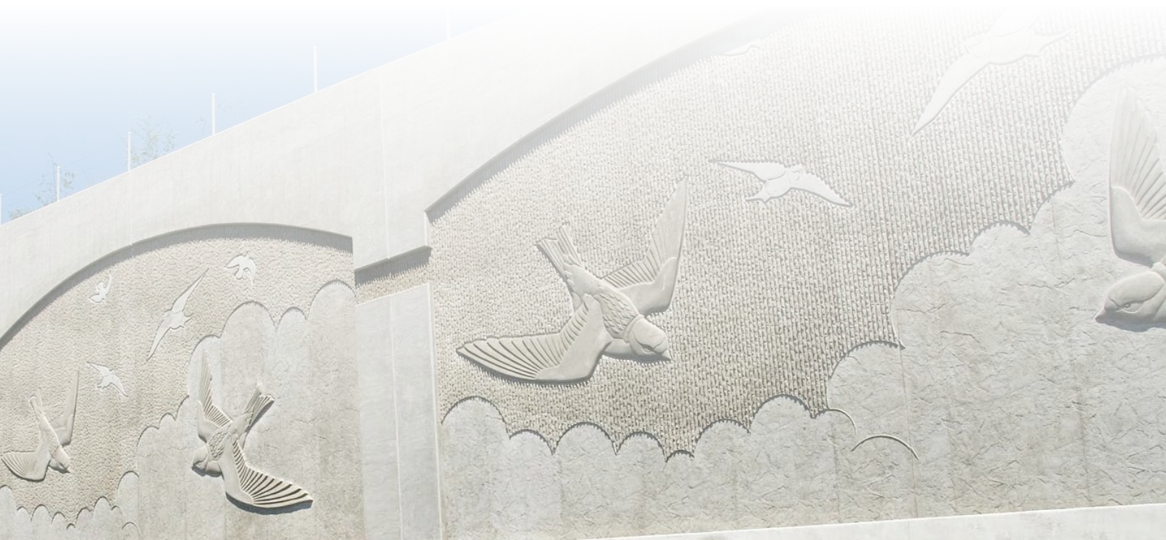
Soundwall along Interstate 5 in Orange County showing the swallows of San Juan Capistrano