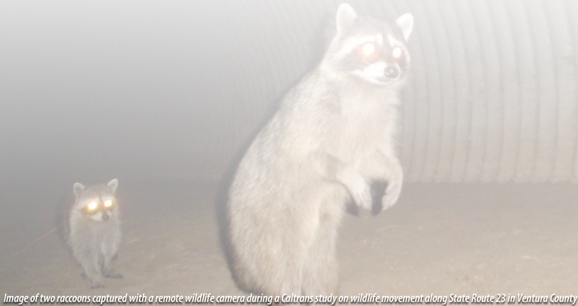
Image of two raccoons captured with a remote wildlife camera during a Caltrans study on wildlife movement along State Route 23 in Ventura County