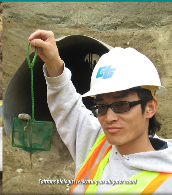
Caltrans biologist relocating an alligator lizard

Carrying out Caltrans' mission to "Provide a safe, sustainable, integrated and efficient transportation system to enhance California's economy and livability."