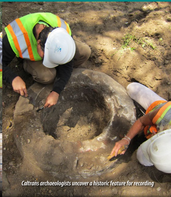
Caltrans archaeologists uncover a historic feature for recording