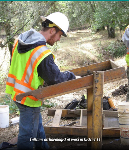
Caltrans archaeologist at work in District 11