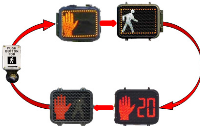
Image 2: Working Cycle of the Yellow LED Border on Pedestrian Signal

The contents of this document reflect the views of the authors, who are responsible for the facts and accuracy of the data presented herein. The contents do not necessarily reflect the official views or policies of the California Department of Transportation, the State of California, or the Federal Highway Administration. This document does not constitute a standard, specification, or regulation. No part of this publication should be construed as an endorsement for a commercial product, manufacturer, contractor, or consultant. Any trade names or photos of commercial products appearing in this document are for clarity only.