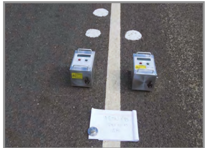
Measuring the pavement macrotexture with a laser texture scanner