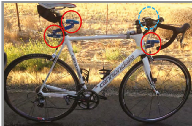
Bicycle instrumented with accelerometers

The goal was to address the impact of chip seals on bicyclists and evaluate various means to improve the ride quality.