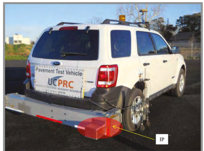
Instrumented vehicle with inertial profiler