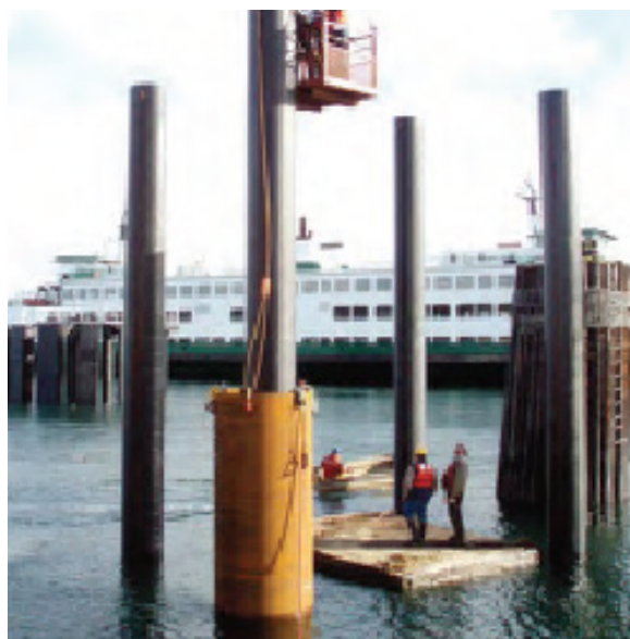
IMAGE 1: Surrounding a 30-inch-diameter pile with a temporary double-walled steel tube to suppress noise