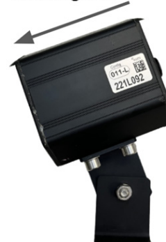
Image 5: iComs TMA-011 LV pedestrian detector as mounted for testing