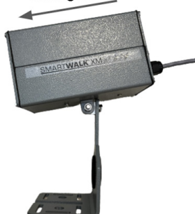
Image 4: MS Sedco Smartwalk XM pedestrian detector as mounted for testing

The contents of this document reflect the views of the authors, who are responsible for the facts and accuracy of the data presented herein. The contents do not necessarily reflect the official views or policies of the California Department of Transportation, the State of California, or the Federal Highway Administration. This document does not constitute a standard, specification, or regulation. No part of this publication should be construed as an endorsement for a commercial product, manufacturer, contractor, or consultant. Any trade names or photos of commercial products appearing in this document are for clarity only.