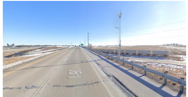
Image 3: Aurora Website – Non-Invasive Sensor Deployment in Aurora Member States