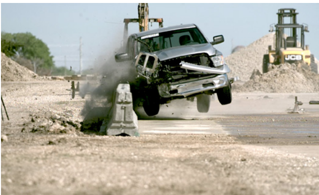
Image 2: Test 616811-01-2 PCC Bolted Roadside Configuration 2023_03_13