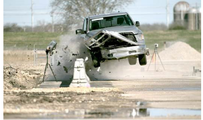
Image 3: Test 616811-01-3 Asphalt Median Configuration 2023_01_19