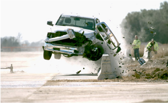
Image 1: Test 616811-01-1 Asphalt Roadside Configuration 2023_01_13