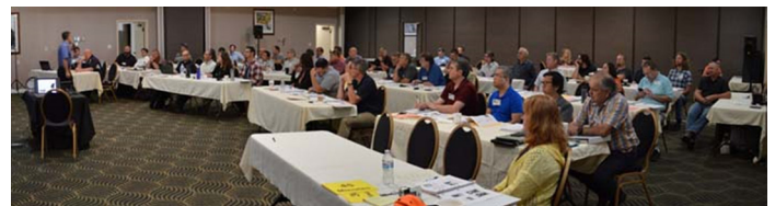
Image 3: Participants listening to a presentation at the Western States Rural Transportation Technology Implementers Forum in Yreka, California