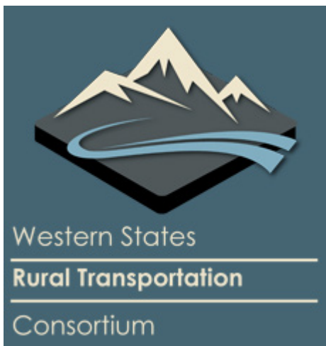
Image 1: Logo for the Western States Rural Transportation Consortium