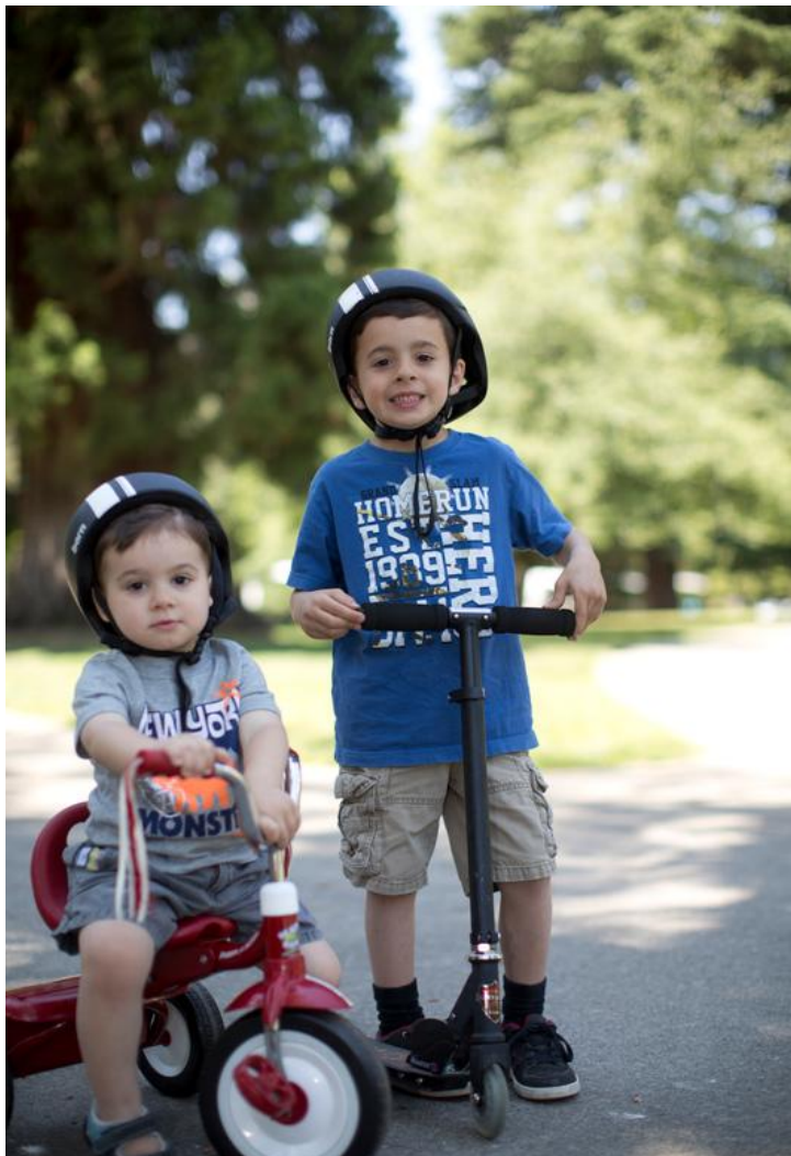
Two future bicyclists at the May is Bike Month Bikefest; held annually at the California State Capitol Building

This chapter highlights bicycle and pedestrian projects that were completed during FY 2013–14. It also details the positive impacts that these projects are having on the communities that built them. With the ATP, the positive benefits of such projects will accrue well into the future; providing more modal choices, a smaller “carbon footprint,” and increased safety and access for all California citizens.